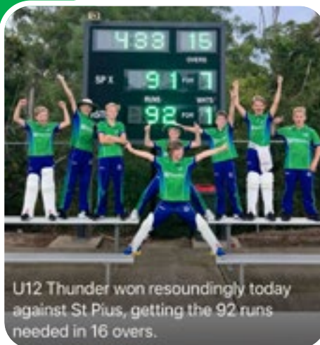
U12 Thunder won resoundingly today against St Pius, getting the 92 runs needed in 16 overs.